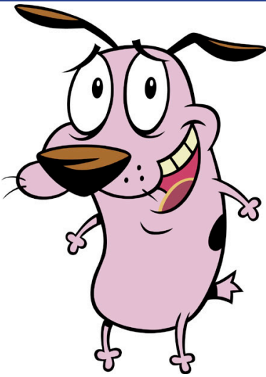
This character's name: