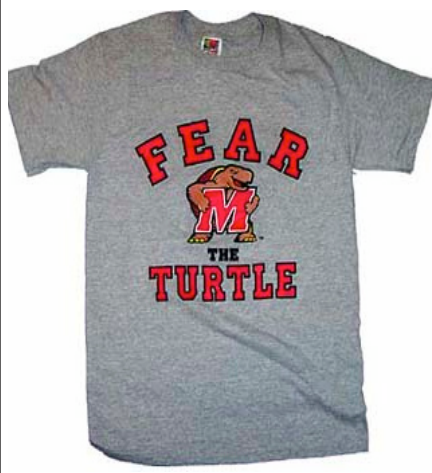
This t-shirt's University: