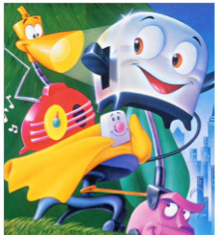
The title of this film: