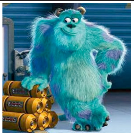
This character's occupation: