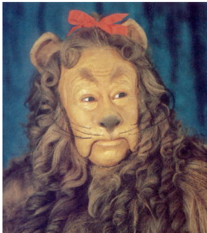
This character's name: