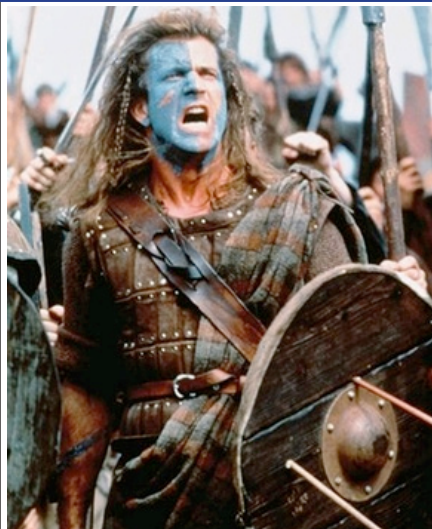
The title of this film: