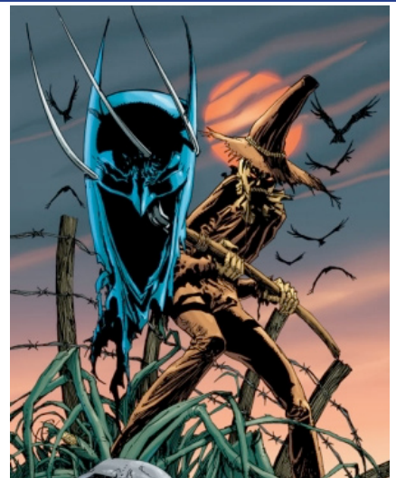
This villain's name: